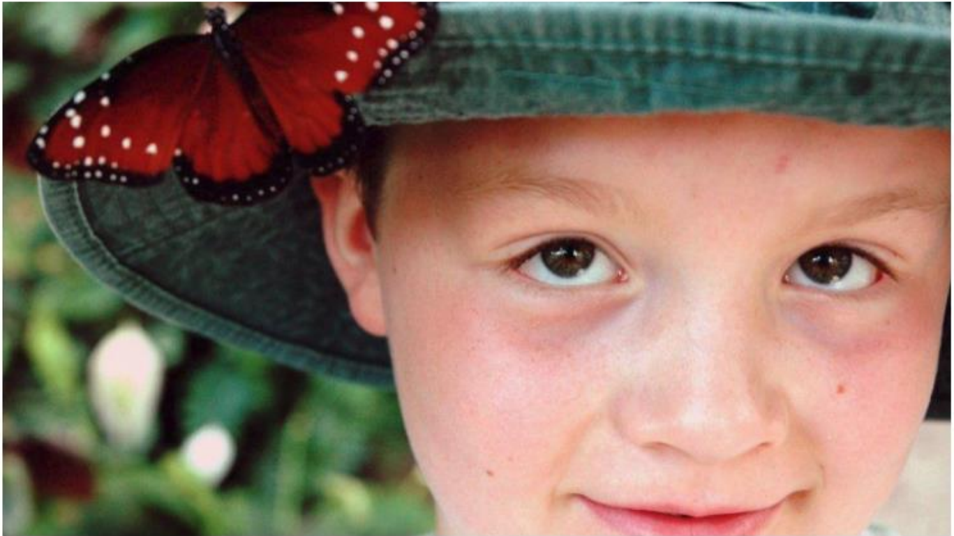
Butterfly Kaleidoscope returns to the Indianapolis Zoo Hilbert Conservatory in March after a yearlong hiatus.