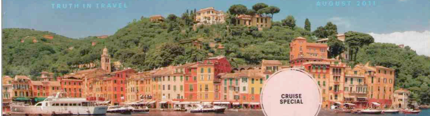
Land ho! Portofino, Italy