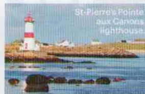
St-Pierre's Pointe aux Canons lighthouse.