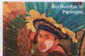
Boi Bumba in Parintins.