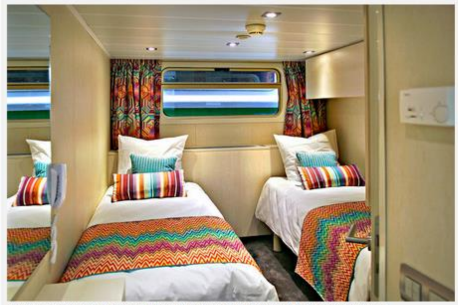
CroisiEurope leads barge cruises along French waterways on vessels that feature just 12 cabins.