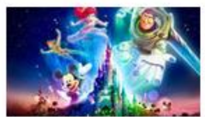
France: What's right, what's wrong and what's next at Disneyland Paris