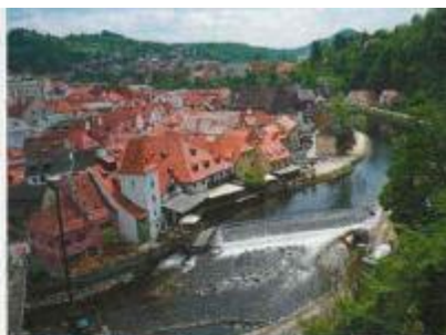
Cesky Krumlov in Czech Republic is an optional excursion on Crystal's Danube sailings.

Other wine-focused regions in France, Germany and other European countries also await romantic travel-