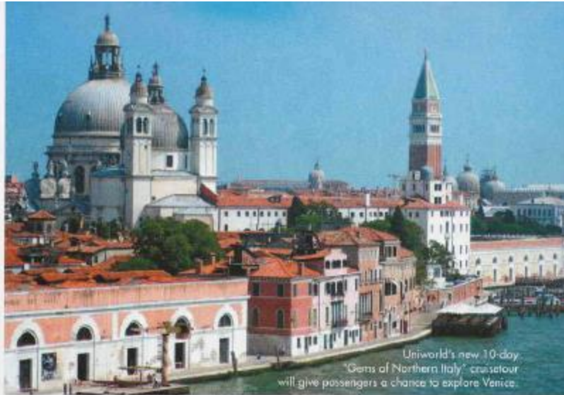
Uniworld's new 10-day "Gems of Northern Italy" cruisetour will give passengers a chance to explore Venice.

Crystal Ravel will launch on European rivers in 2017.