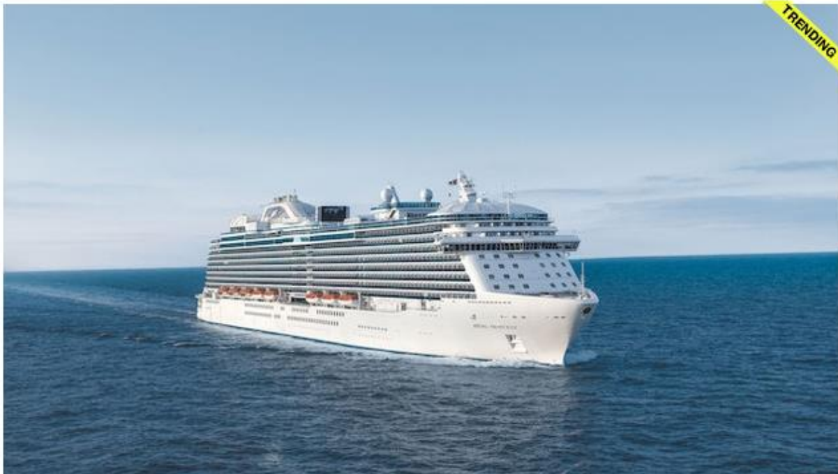
PHOTO: The Regal Princess, the first of the Medallion Class ships.

CRUISE LINE & CRUISE SHIP | PRINCESS CRUISES | JASON LEPPERT | JANUARY 04, 2017