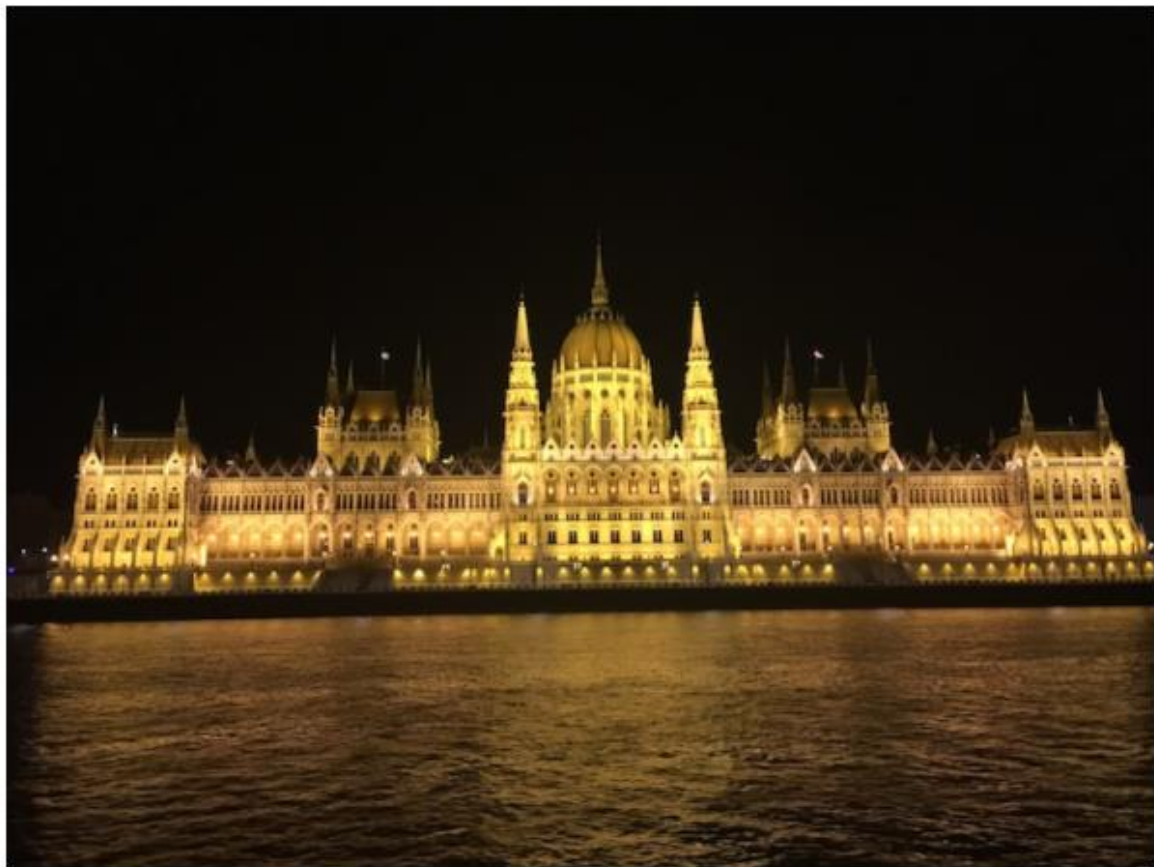
Hungarian Parliament at night, seen from our CroisiEurope cruise on the Danube

One of my favorite things to do in Budapest is to take a nighttime boat ride on the Danube River. Every night, Budapest lights up its gorgeous architecture. This summer, my husband, a friend, and I enjoyed an hour-long sunset cruise. To get our bearings in Budapest, we spent our first evening on the boat ride. Tickets sell out in summer, so we bought them that morning. And buying the day before is even safer.