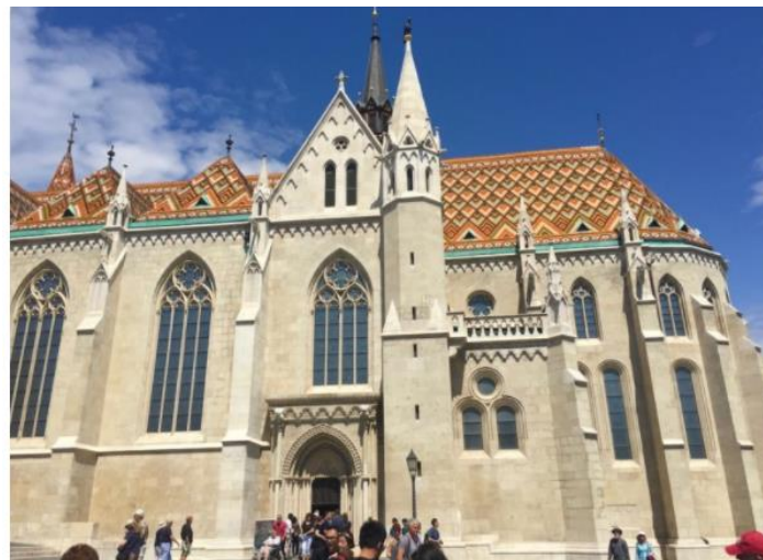
Matthias Church's brightly tiled roof against a blue sky

Among the best things to do in Budapest, Hungary are enjoy pastries while sipping coffee in luxurious cafes, explore its gorgeous architecture, or visit a public bath, says World TravelingMom. Or walk its bridges over the Danube River for great views of the city. At night, the city lights up its monuments, a dramatic sight best appreciated from a boat on the river. Ready for more tips? Read on for this and other things to do in Budapest.