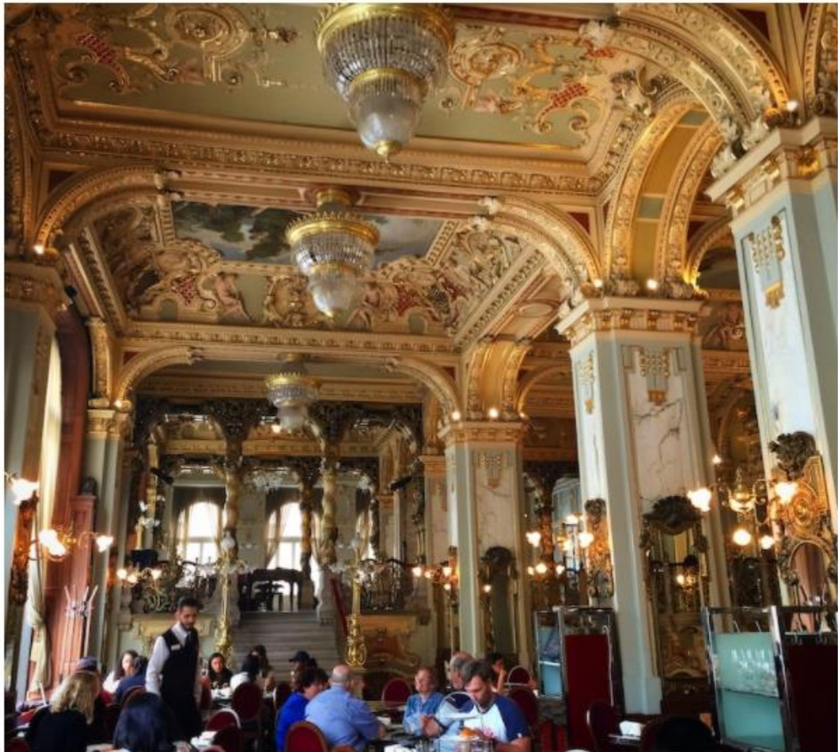
Pastry at New York Café is among the best things to do in Budapest

On top of Castle Hill in Buda is Fisherman's Bastion, a cluster of terraces and staircases overlooking the city. It's free to visit and take in the view. Also on top of Castle Hill is Matthias Church. Its brightly colored tile roof contrasts with a blue sky. Inside, the church is colorfully decorated with folk patterns that make it feel distinctively Hungarian. We sipped drinks at the outdoor café on Castle Hill, enjoying its stunning view. Castle Hill also has monuments and a gorgeous fountain.