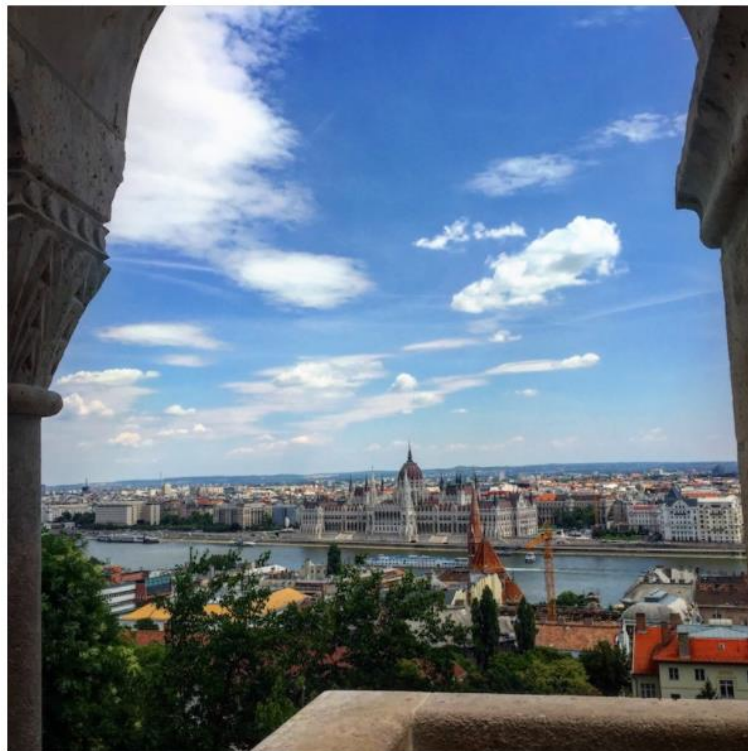
Arch at Fisherman's Bastion on Castle Hill frames the view of the city below.

For a glorious panoramic view of the city and river, we went up the hill in Buda. We've gone three different ways. First, we climbed Castle Hill in Buda. Then we took the fun funicular ride. Last, we drove up in a tour bus arranged by our Danube River cruise with CroisiEurope Each time, we stayed on Castle Hill in Buda for several hours, because there's lots to see.