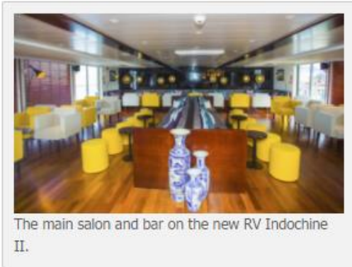
The main salon and bar on the new RV Indochine II.

The ship accommodates 62 passengers in 31 cabins each measuring 194 square feet with 43-square-foot private balconies. The vessel measures 213-feet long and 43-feet wide and has a 3.2-foot reduced draft. Cabins are spacious, located behind colonial slatted doors, with separate bathroom and toilet facilities. Wide decks include multiples areas where guests can relax and have fun on the bow, near the restaurant and the water, and at the bar on the stern of the upper deck. A large outside lounge surrounds a raised, cool-water pool shaded by one of the ship's two awnings.