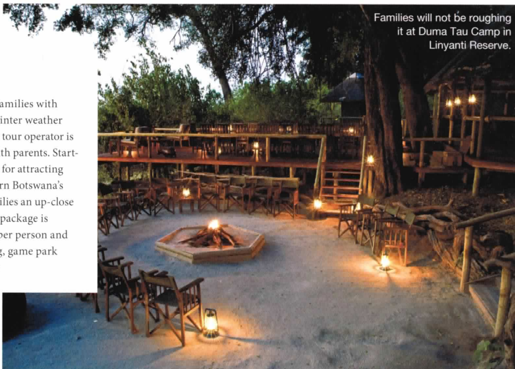
Families will not be roughing it at Duma Tau Camp in Linyanti Reserve.