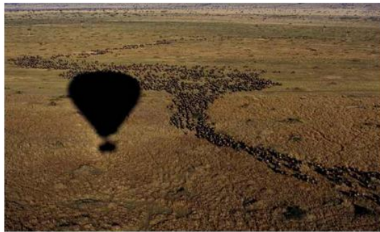
Extraordinary Journeys Africa is offering 25 per cent to 30 per cent off some unique trips. Witness the 3-million-strong migration of wildebeest as they roam the Serengeti, or go on safari in an open-roof 4x4 vehicle with experienced naturalist guides.