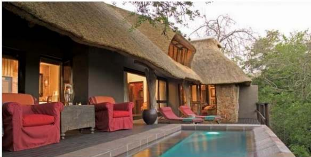
Singita Ebony Lodge.

Extraordinary Journeys has created an itinerary for a safari through South Africa featuring game-viewing and wine tastings.