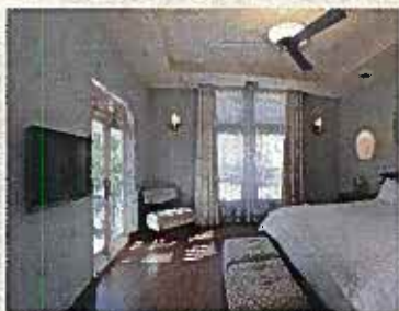
A guestroom at Cotton Tree.

Cotton Tree Phone: (345) 943-0700 Web: www.caymancottontree.com