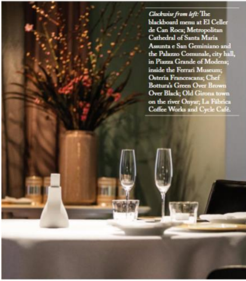
Clockwise from left: The blackboard menu at El Celler de Can Roca; Metropolitan Cathedral of Santa Maria Assunta e San Geminiano and the Palazzo Comunale, city hall, in Piazza Grande of Modena; inside the Ferrari Museum; Osteria Francescana; Chef Bottura's Green Over Brown Over Black; Old Girona town on the river Onyar; La Fàbrica Coffee Works and Cycle Café.

INSIDE TRACK For those passing through with a dinner reservation and a factory tour, book the two-room Quartopiano B&B de Charmo (from $120; bbquartopiano.it ). Mon Café owners converted the attic apartment and arrange local activities for their guests. They likely will recommend the Driving with the Stars exhibit at Enzo Ferrari Museum ( musei.ferrari.com ), running through the end of the year and showcasing cars used by royal families and celebrities. Booking a tour of the Pagani automotive factory ( pagani.com ) is another favorite. Earlier this year, online tour matchmaker Zicasso ( zicasso.com ) launched the 10-day Prestige & Passion of Italy: Celebrating 350 Years of Italian Racing Tradition (from $4,129 per person) to mark the 70th anniversary of Ferrari producing its first vehicle. The tour highlights the best of the Motor Valley, including Modena, Bologna, and Maranello. >