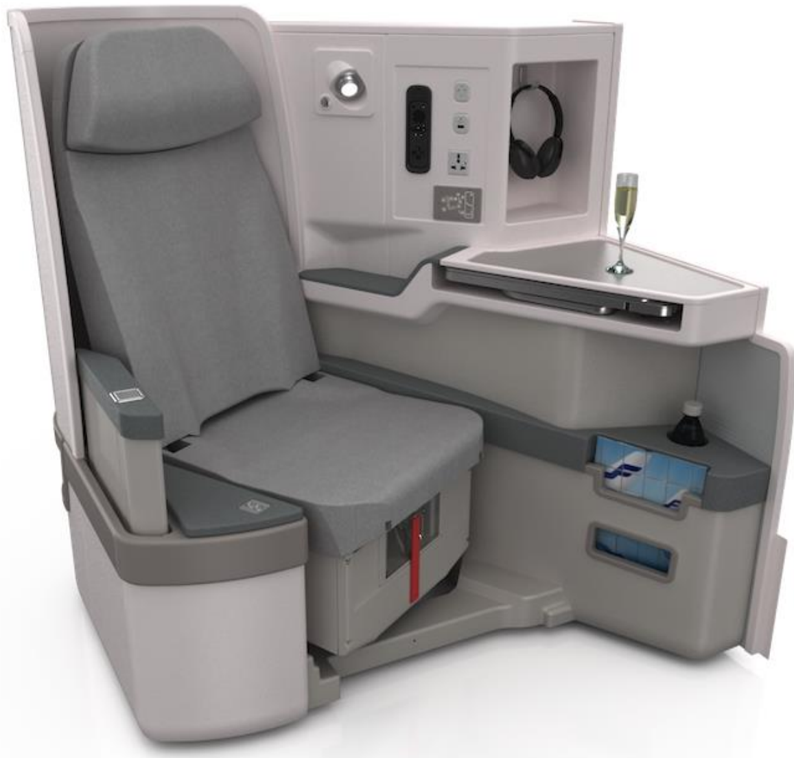
Finnair A350 business class

As of now, Finnair only flies the A350 between Helsinki and Shanghai, and as of late December they'll also fly it to Bangkok. At later dates they'll be flying the A350 to Beijing, Hong Kong, and Singapore as well. Noticeably absent is the US, which just doesn't seem like a very strong market for them.