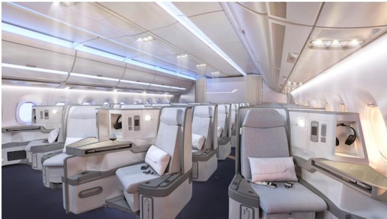
Finnair A350 business class

They have a brand new business class product on the A350 , which looks top notch. The seats are in a reverse herringbone configuration, and I sort of love the simple and subtle finishes which feel very... Finnish (see what I did there?). 😊