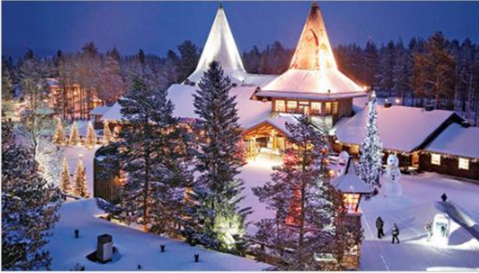
Lapland: Santa Claus Village in Rovaniemi 30