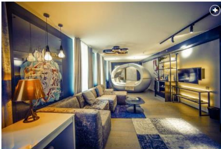
Mod design at the Klaus K hotel. Design Hotels