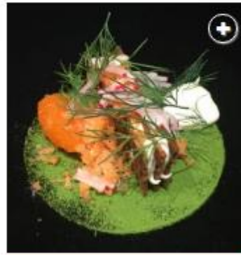
Gobble up at flnicky Finnjäväl. Nico Bäckström

Think reindeer with lingonberries and mousse made of pine bark. Markets, including the Old Market Hall and Hakaniemi Market Hall, sell ready-to-eat slices of rye slathered with salmon and pastries like Runeberg torte, a k a almond and raspberry cake.