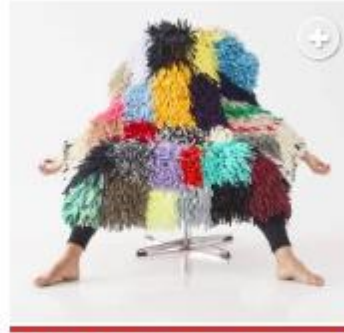
Fun creations at the Design Museum.

Fun fact: 80 percent of Finland is covered in forest. The tree-filled country is home to 39 national parks, which are utilized year-round. During colder times, they become playgrounds for cross-country skiing and snowshoeing; in warmer climes, they offer hiking trails and canoeing. One of the most accessible green spaces from Helsinki — a 30-minute drive away — is Nuukio National Park . The park offers countless outdoor activities from birdwatching to berry-picking and a newly built nature center, which houses a killer restaurant serving hearty farm-to-table food.