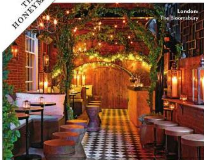
London: The Bloomsbury