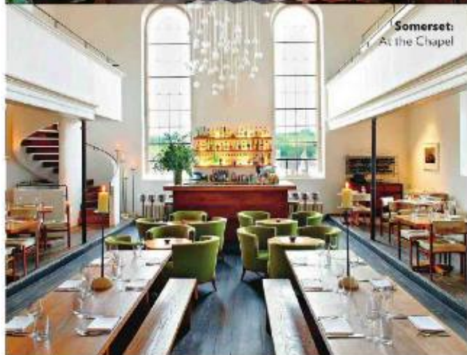
Somerset: At the Chapel