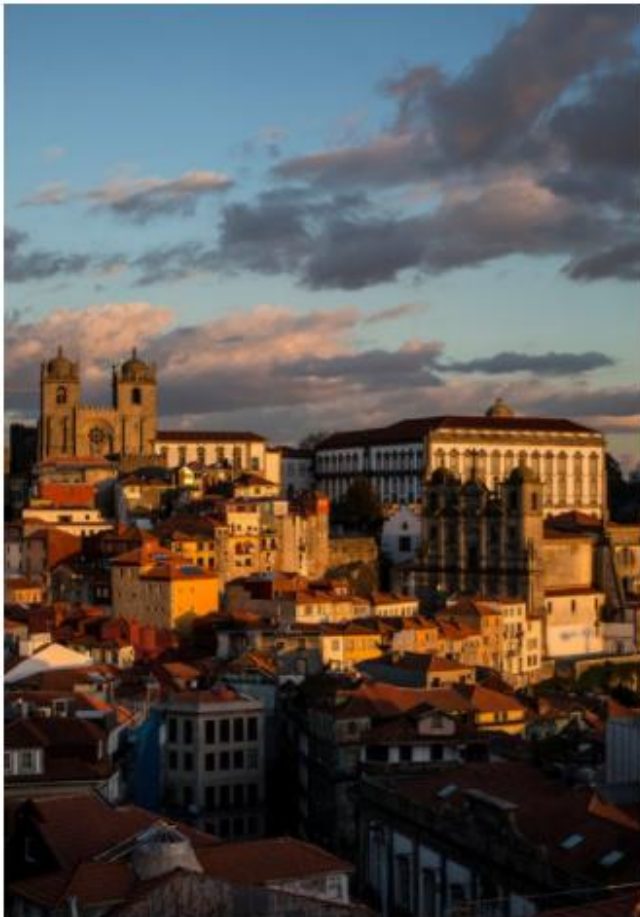
The Cathedral of Porto in Porto, Portugal.

Travelers with ambitious travel plans may find additional multicity routes at bargain rates as international airlines add free stopovers and other incentives to make the midway hub a second destination.