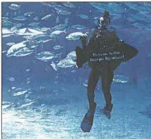
A diver can pose the question in Atlanta, left. Or maybe you like the ambience of New Orleans, right.