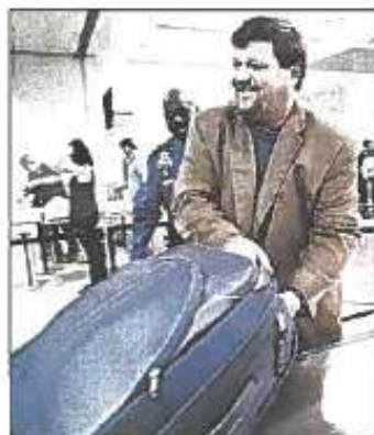
Los Angeles joins five other cities with airports that have pre-screening lanes, such as this one in Miami.