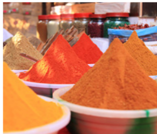
Foodies can visit India's spice markets with Geringer Global Travel.

Clients can experience the flavors of India during a 15-day culinary journey with Geringer Global Travel. The itinerary includes a tea tour, celebrating the diversity of regional Indian cuisine and its world famous tea production. Extending beyond popular favorites, the tour delves into the heart of Indian cooking, introducing the distinctive styles and seasonings of South Indian, Punjabi, Awadhi, Brahmin and Bengali dishes. Travelers will not only observe cooking demonstrations, they will have the opportunity to speak with chefs, shop for spices and even roll up their sleeves in the kitchen. The tour includes visits to distinctive cultural landmarks in Delhi, Lucknow, Varanasi, Kolkata, Kalimpong and Gangtok, before ending in world-famous Darjeeling with a stay at its Glenburn Tea Estate.