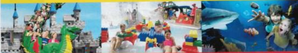
LEGOLAND® California Park