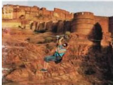
Geringer Global Travel's India Family Odyssey tour offers a zipline adventure at Mehrangarh Fort.

Geringer's new tour goes to India's most popular destinations and attractions, like