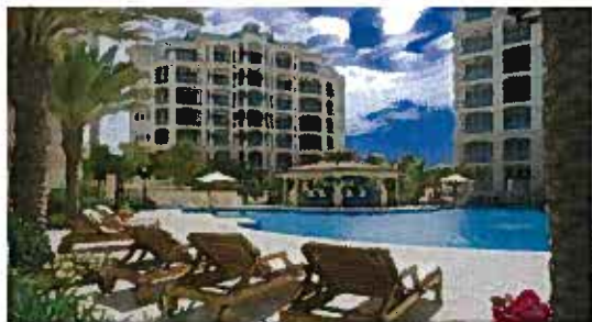
The pool at Seven Stars Resort.

GRACE BAY, Turks and Caicos — Seven Stars Resort here is offering a tax-free getaway on bookings of at least four nights through May 31.