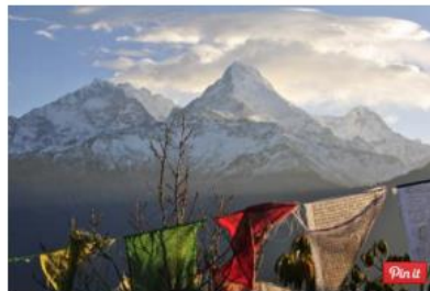
Prayer flags in Annapurna, Nepal.