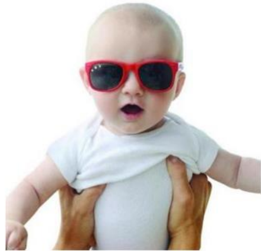
Sunglasses from ro•sham•bo.