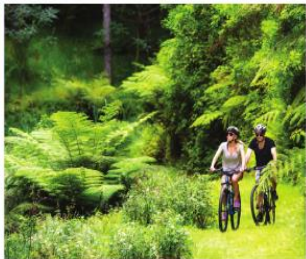
Drew McQueen Photography