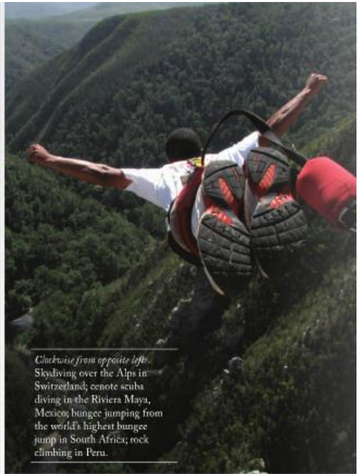
Clockwise from opposite left: Skydiving over the Alps in Switzerland; cenote scuba diving in the Riviera Maya, Mexico; bungee jumping from the world's highest bungee jump in South Africa; rock climbing in Peru.

Travelers seeking excitement and thrills will flip over these five dramatic destinations. Whether it's for a mountain summit or a death-defying freefall, the search for greater highs and lows on vacation ends here.