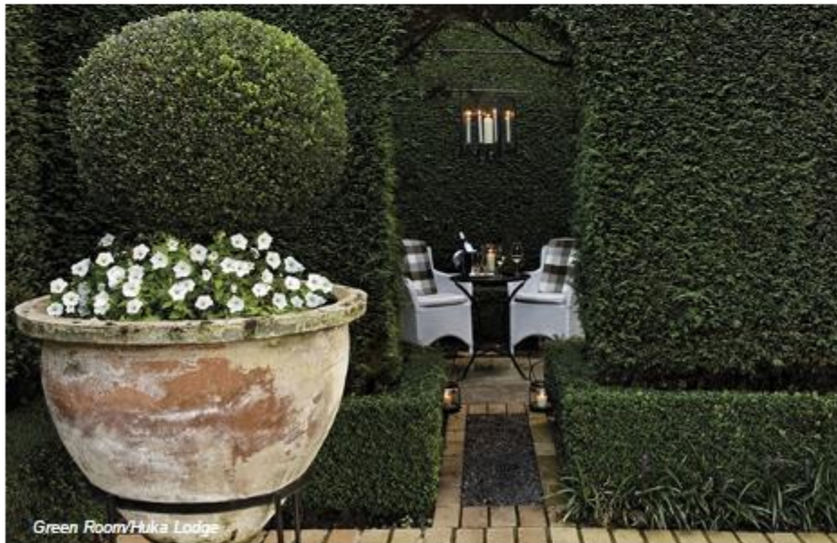
Green Room/Huka Lodge