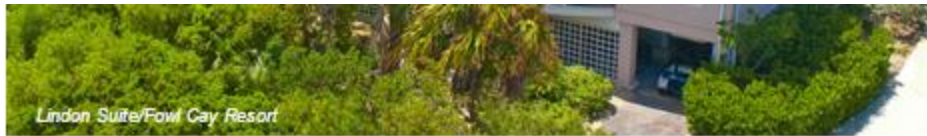
Lindon Suite/Fowl Cay Resort