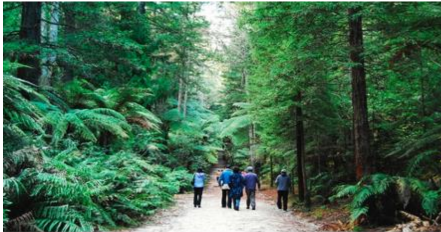
PHOTO: The Redwood forest in Rotorua was used in "Pete's Dragon." (Photo courtesy Tourism New Zealand)

DESTINATION & TOURISM | JANEEN CHRISTOFF | FEBRUARY 23, 2016