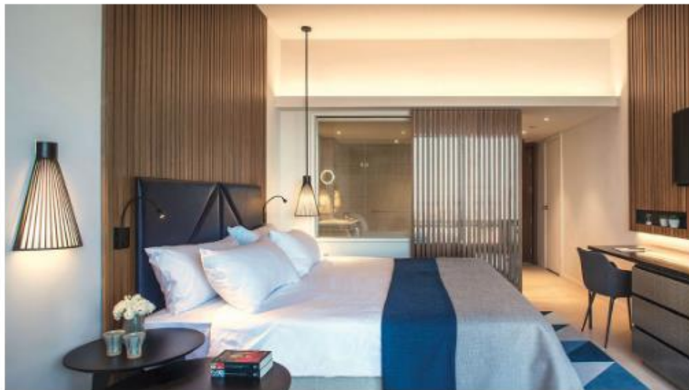
A guestroom in the Dan Accadia hotel. It is renovating 140 of its 208 rooms, a project scheduled to be completed before Passover in April.