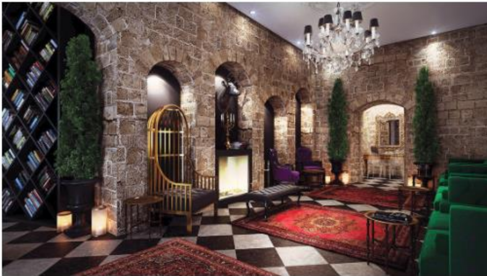
A rendering of the lobby of the Villa Brown Jerusalem hotel, a 24-room property scheduled to open next month.

Amenities include a rooftop spa and open-air Jacuzzi and a lobby library featuring design and lifestyle publications in multiple languages.