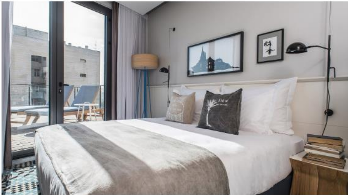
A Terrace Room at the recently opened Bezelel Hotel in Jerusalem.