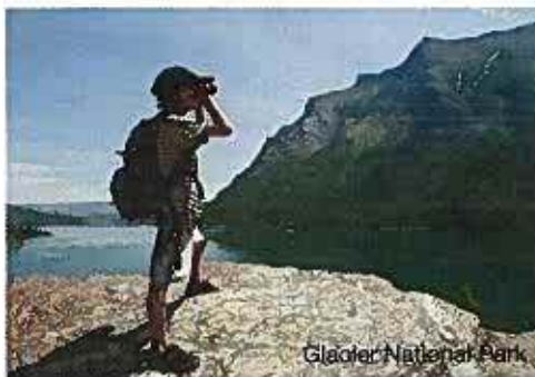
Glacier National Park