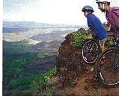
Waimea Canyon on Kauai

Yosemite National Park, which receives millions of visitors annually has enough types of accommodations to fit anyone's budget — from campgrounds to the modest Curry Village tent cabins. Day trips and hiking are free at the Grand Canyon, and there's affordable lodging throughout the park and just outside of it.