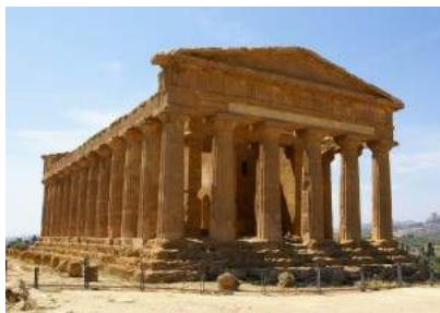
Ancient Greeks built the Temple of Concordia in Agrigento, Sicily in the 5th century BC