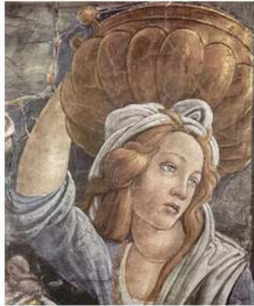
Botticelli's "Trials of Moses" masterpiece is located in the Sistine Chapel.