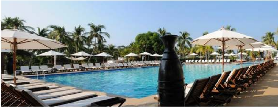
Club Med Ixtapa Pacific.

Agents can earn big in April with special programs and extra commission with offers from Travel Leaders , Learning Journeys and Club Med .