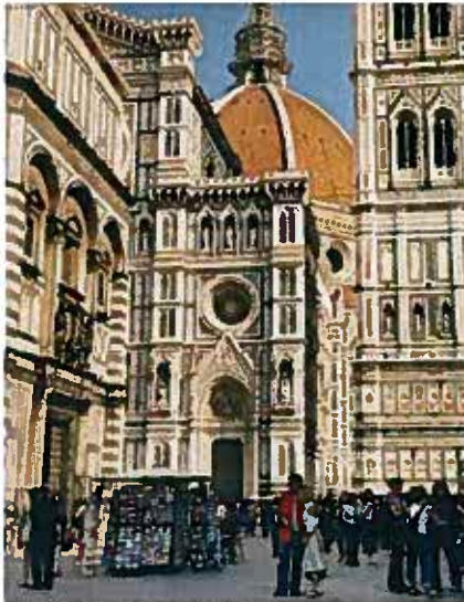
The Duomo cathedral in Florence.

"FITs used to be an extremely long process of booking and confirming with all the services in Italy. And now it's much, much faster," he said.