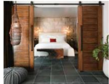
Grotto (top) and Soulstice Suite at Two Bunch Palms.

Channel your inner artists by signing up for the resort's VINO and Van Gogh, a combo painting session and wine tasting. And before you leave, bang the drum slowly at the spiritual drumming class led by a resident shaman. 67425 Two Bunch Palms Trail, (800) 472-4334, www.twobunchpalms.com .