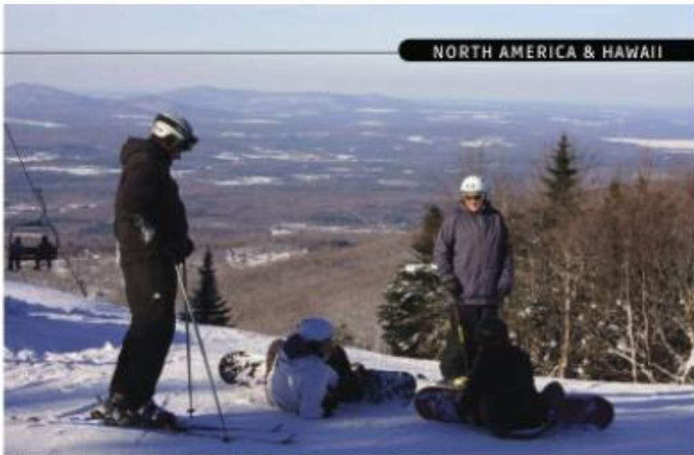
Skiing from the top at Sutton Mountain, Sutton, Eastern Townships, Quebec

Another to suggest is laid-back Owl's Head