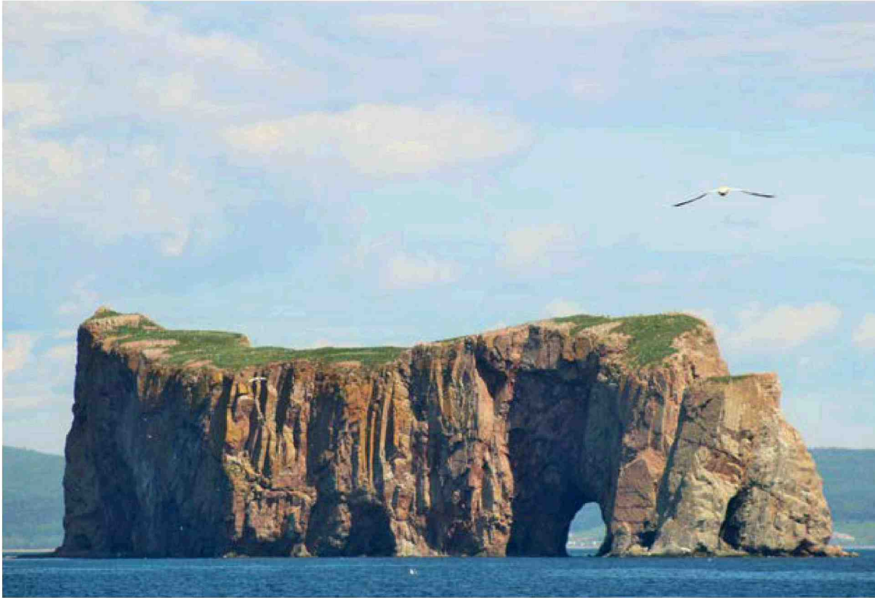
ALAN SOLOMON Chicago Tribune

A visit to Gaspesie is incomplete without viewing Perce Rock, one of Canada's natural treasures.