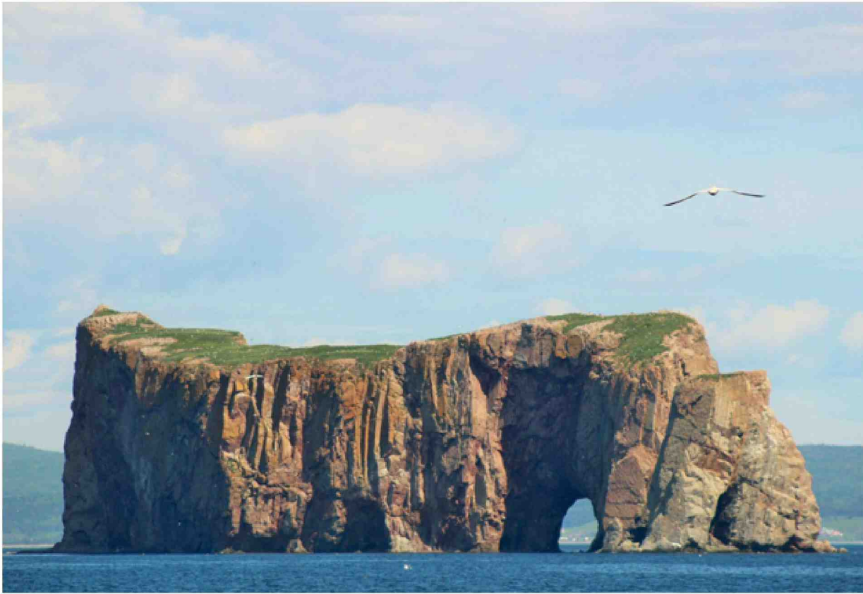
ALAN SOLOMON Chicago Tribune

A visit to Gaspesie is incomplete without viewing Perce Rock, one of Canada's natural treasures.