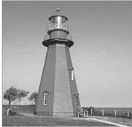
SYLVIE BIGAR | WASHINGTON POST

This land, with its forests and mountains, marshes and meadows, still attracts men and birds. Now protected, the cod cannot be far behind.