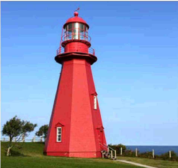
SYLVIE BIGAR For The Washington Post

A visit to Gaspesie is incomplete without viewing Perce Rock, one of Canada's natural treasures.