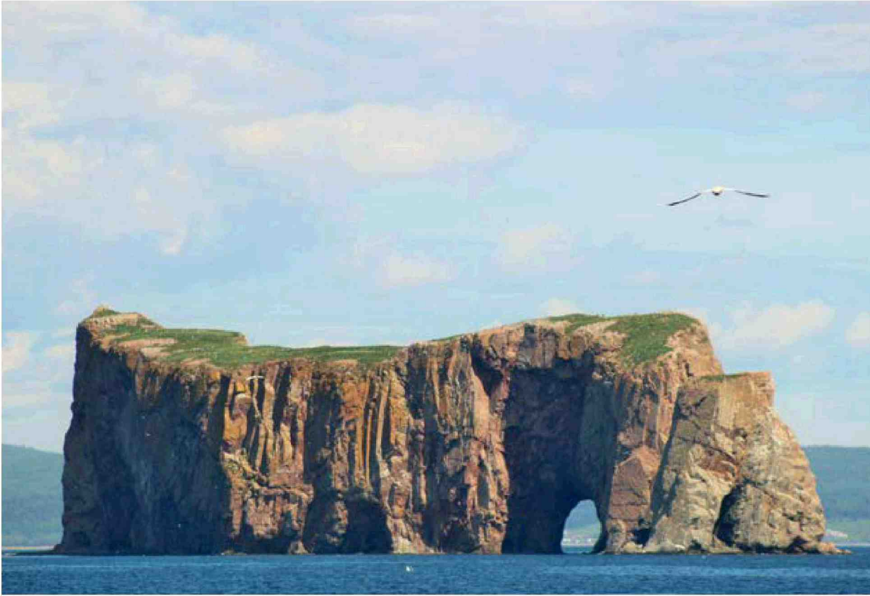
ALAN SOLOMON Chicago Tribune

Date: Sunday, November 05, 2017 Location: HILTON HEAD ISLAND, SC Circulation (DMA): 17,117 (97) Type (Frequency): Newspaper (S) Page: 36 Section: Extra Keyword: Bonaventure Island