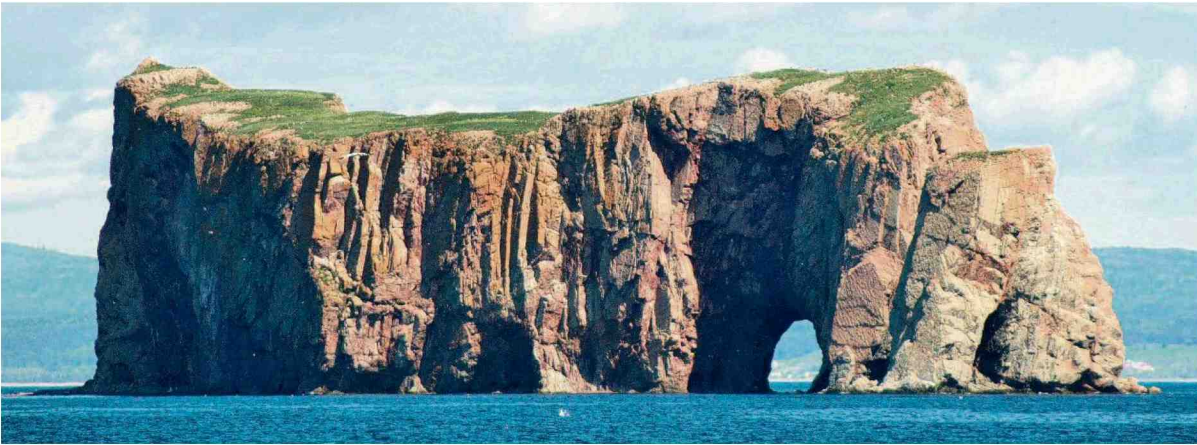
ALAN SOLOMON Chicago Tribune

A visit to Gaspesie is incomplete without viewing Perce Rock, one of Canada's natural treasures.