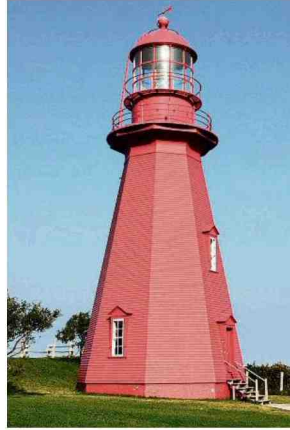
SYLVIE BIGAR For Washington Post

This land, with its forests and mountains, marshes and meadows, still attracts men and birds. Now protected, the cod cannot be far behind.