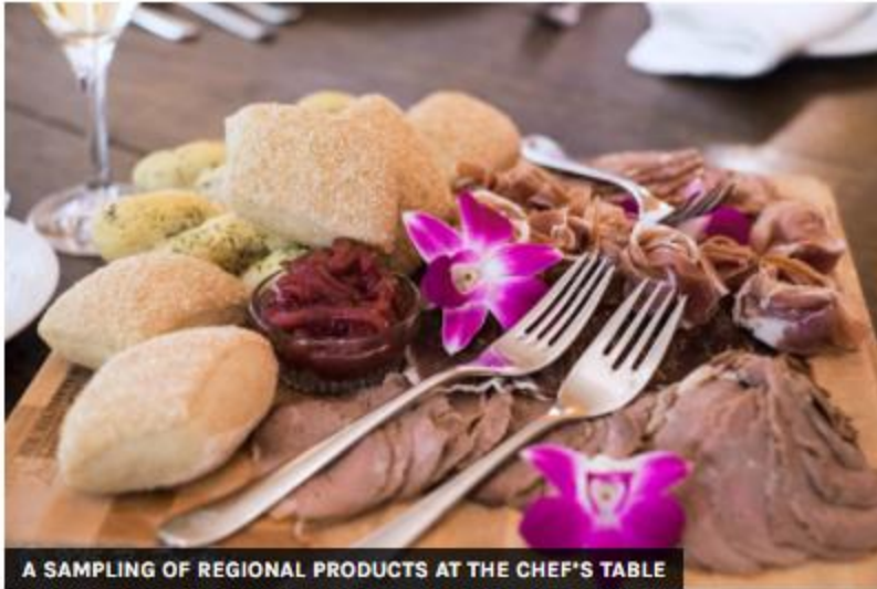
A SAMPLING OF REGIONAL PRODUCTS AT THE CHEF'S TABLE