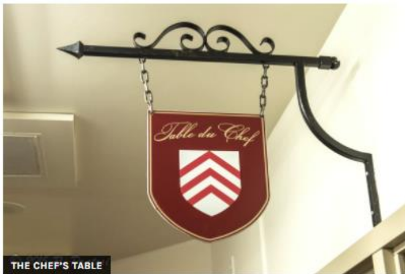
THE CHEF'S TABLE