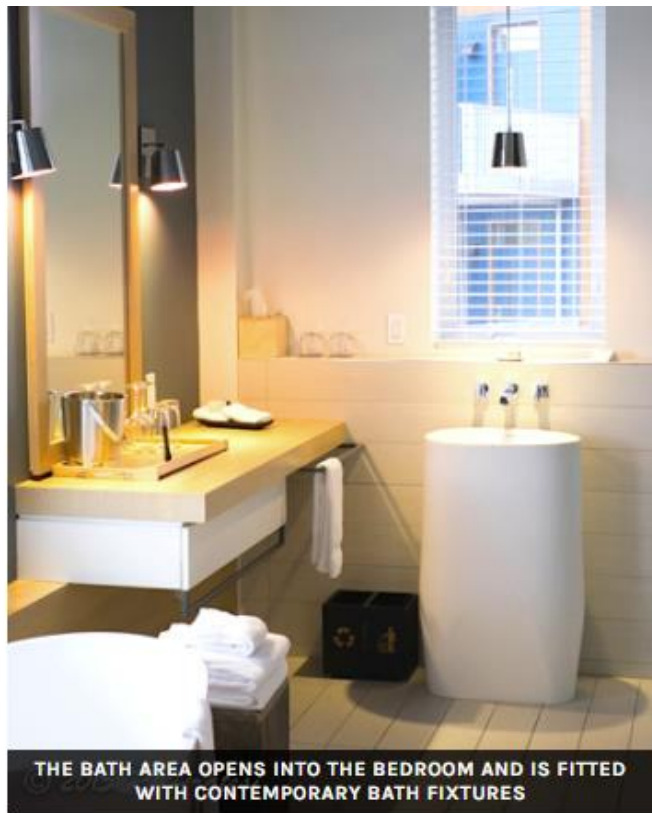
THE BATH AREA OPENS INTO THE BEDROOM AND IS FITTED WITH CONTEMPORARY BATH FIXTURES