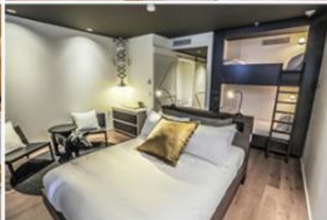
* EACH ROOM STYLE IS UNIQUE IN DECOR

The hotel's Spa du Verger, with its windows overlooking the farm, offers a unique thermal spa experience with hot and cold outdoor pools, a Nordic shower, a snow fountain, Finnish sauna, and a eucalyptus steam bath.