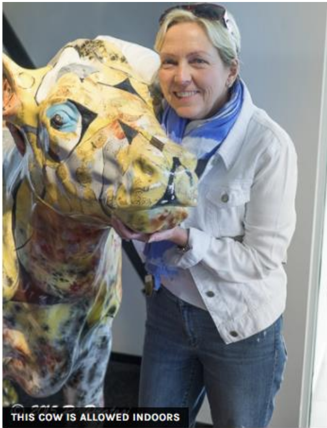
THIS COW IS ALLOWED INDOORS