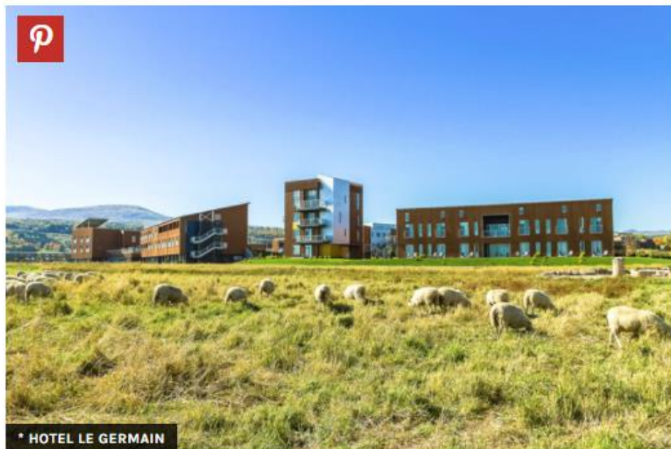
* HOTEL LE GERMAIN

During our time in Charlevoix, we stayed at Hôtel La Ferme, which was recently renamed Hotel Le Germain Charlevoix .