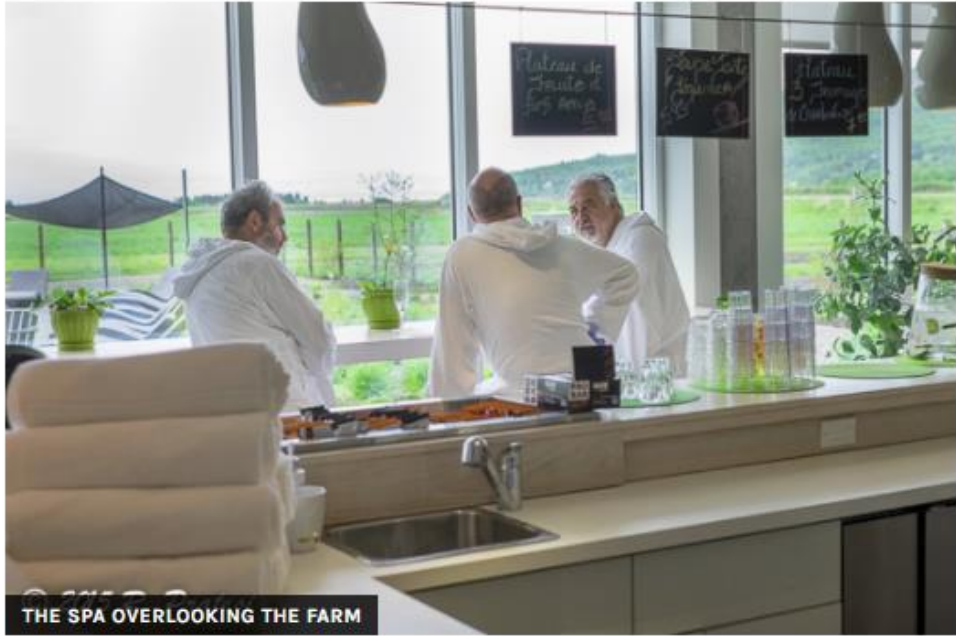
THE SPA OVERLOOKING THE FARM