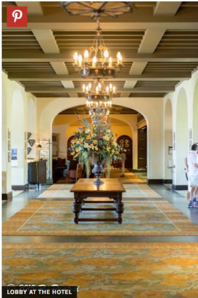
LOBBY AT THE HOTEL