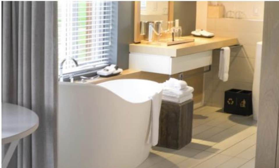
SOAKING TUB OVERLOOKING THE GARDEN WITH VIEWS OF THE ST. LAWRENCE RIVER IN THE DISTANCE