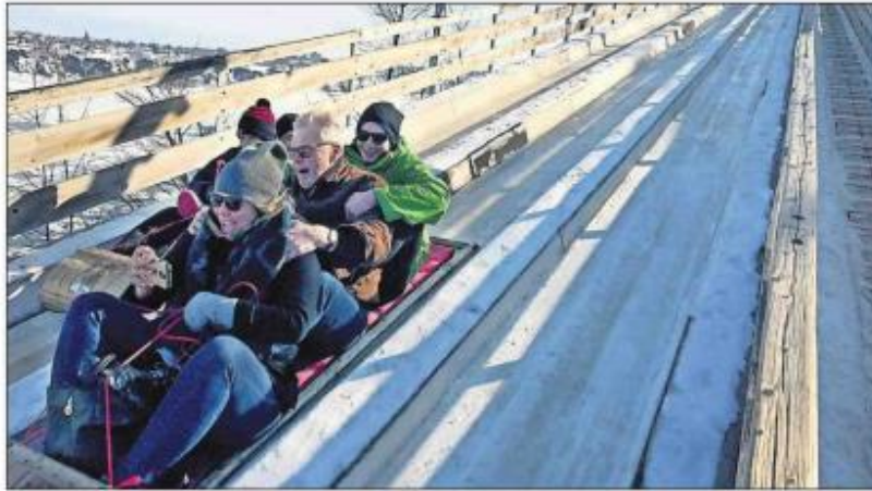
The Toboggan Slide Au 1884 takes you on a thrilling ride along the St. Lawrence River at speeds up to 70 kilometers and hour.