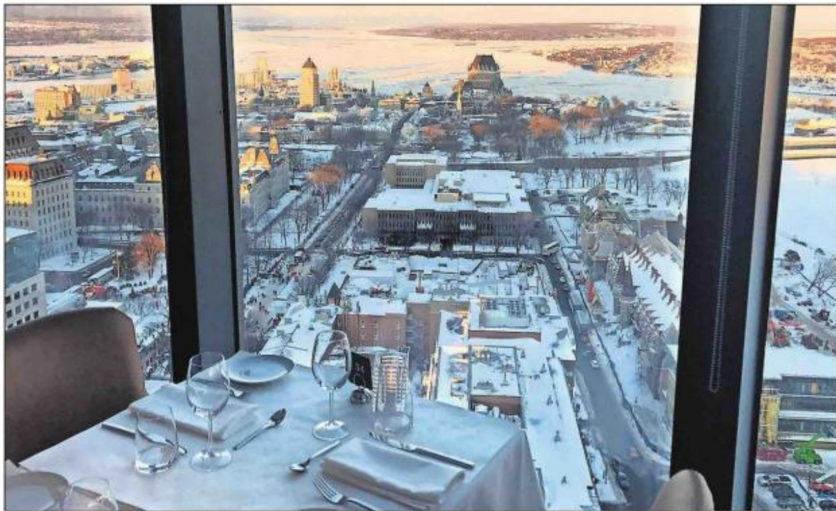
Ciel, a restaurant on the 28th floor of a building on the Grande-Allee, offers magnificent views of the city as it rotates.