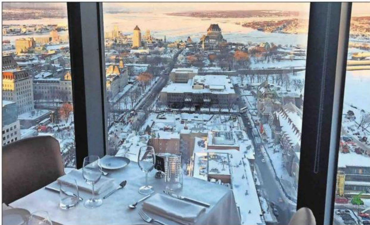
Ciel, a restaurant on the 28th floor of a building on the Grande-Allee, offers magnificent views of the city as it rotates.