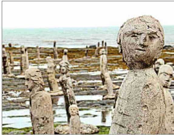
The Gaspe Peninsula contains 14 lighthouses. And there's also no shortage of artistic expression.