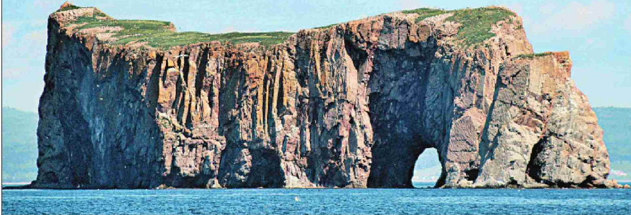
A visit to Gaspésie is incomplete without viewing Perce Rock, one of Canada's natural treasures. It teases photographers with different patterns and colors as the sun makes its rounds.

Quebec's Gaspé Peninsula is hard to get to, easy to love for its many charms