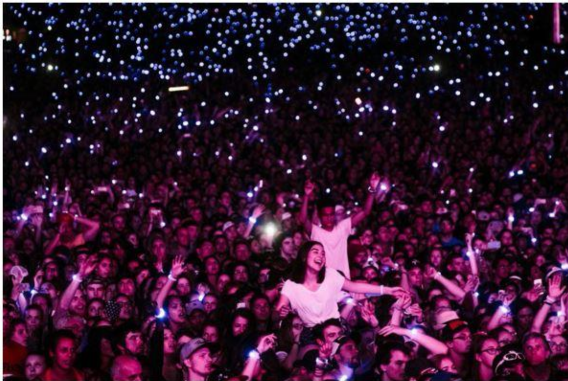
Plains of Abraham Bell Stage