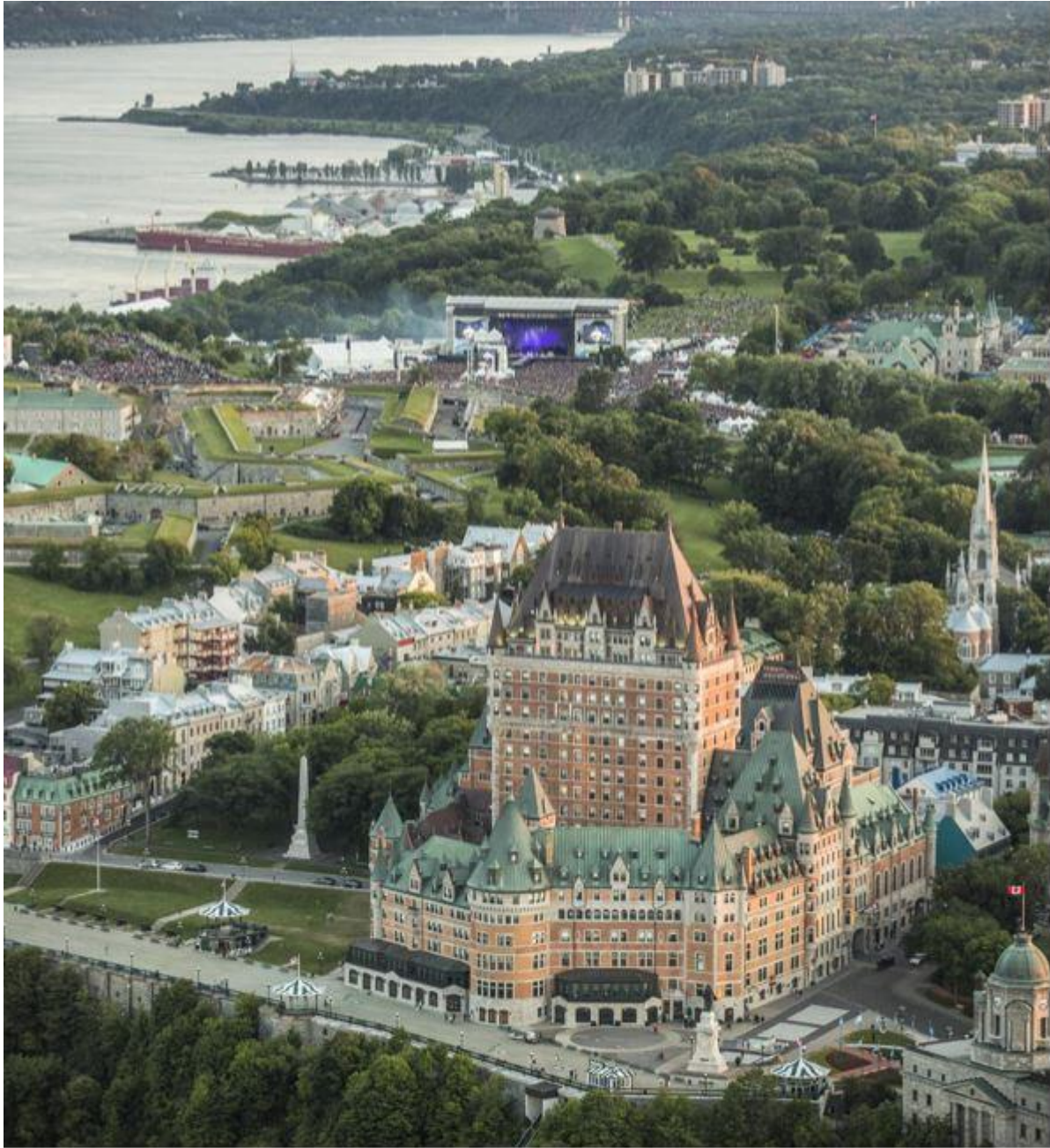
Overview of Québec