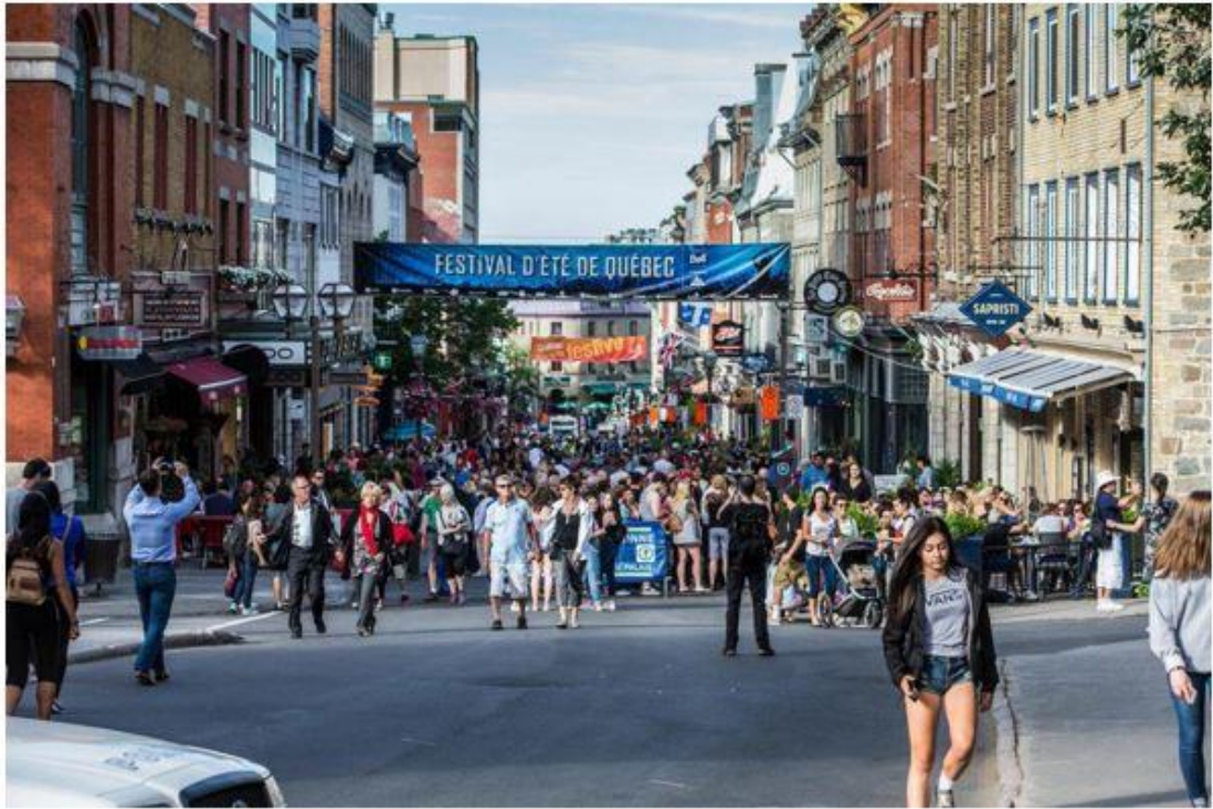
Saint-Jean Street Old Québec