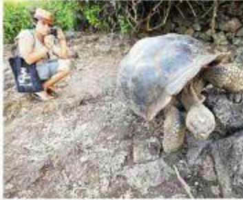
Meet a giant tortoise at Charles Darwin Research Center on Santa Cruz Island.

and taxes. INFO 510-420-1550, nwsdy.li/galapagos