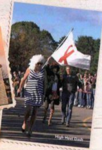
High Heel Day