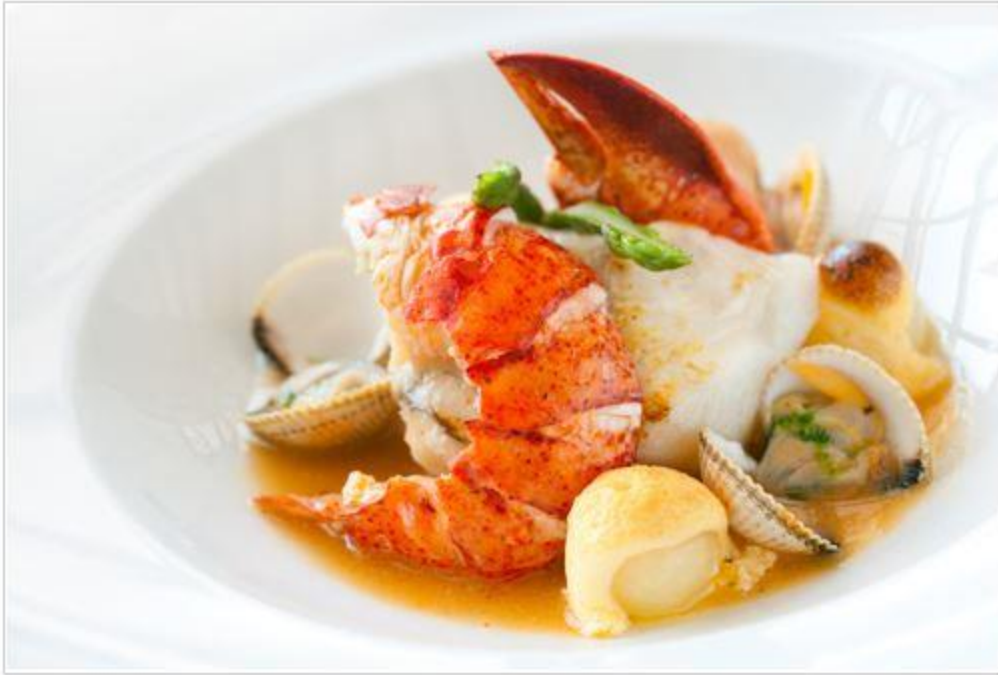
La Table Des Roy