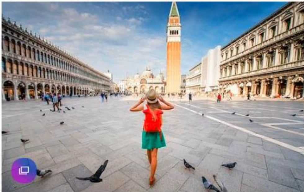
A tourist admiring Piazza San Marco in Venice

Trafalgar (0800 533 5617; trafalgar.com ) offers a departure with no single supplement on Oct 18 from £2,475 including some meals and transfers. Flights cost extra.