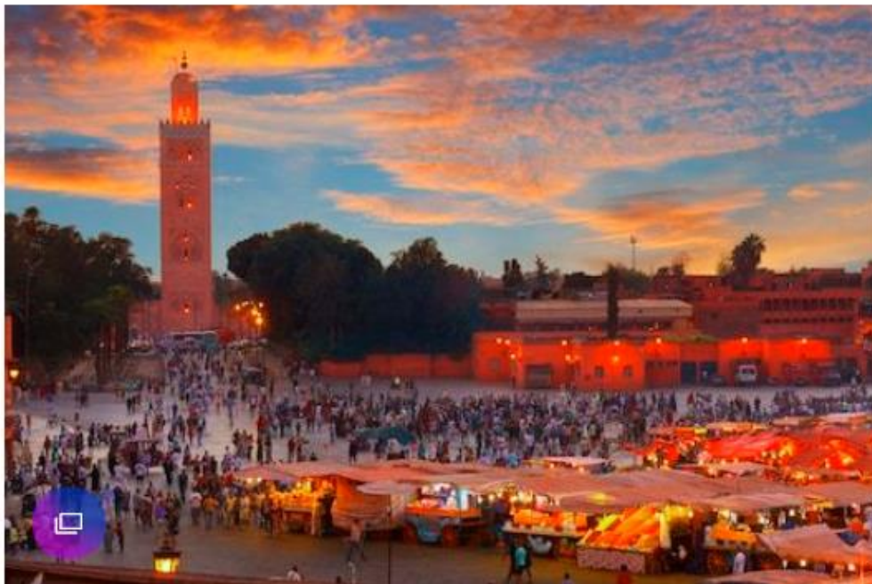
Djemaa el-Fna square

Cox & Kings (020 3627 0921; coxandkings.co.uk ) offers departures between March and Oct, from £1,195 including some meals, flights and transfers.