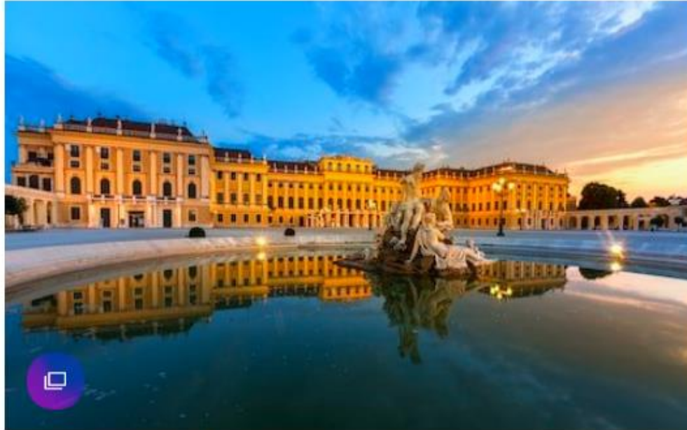
Schönbrunn Palace