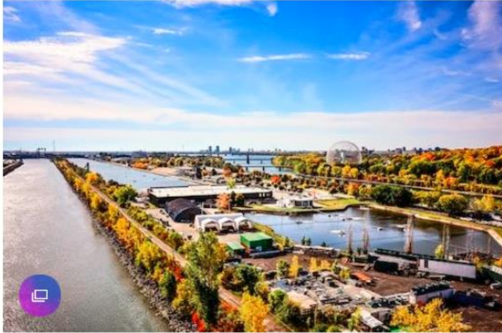
The St Lawrence River in Montreal