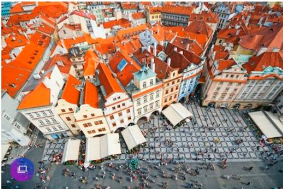
An aerial view of Wenceslas Square

Solos Holidays (0844 815 0005; solosholidays.co.uk ) offers a departure on April 19, from £699 including flights and transfers.