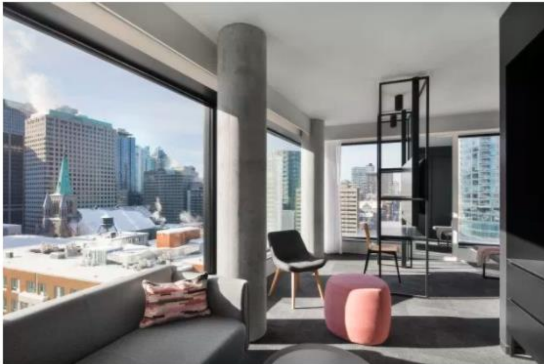
Stark modernism can be found at Monville.