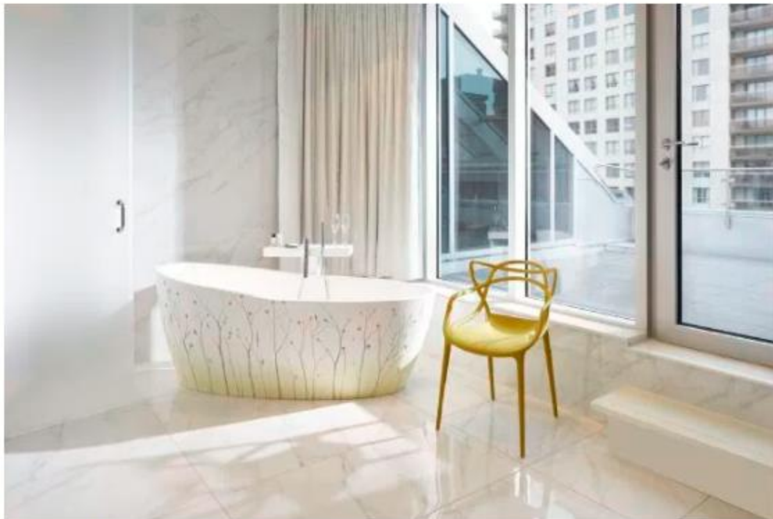
The airy sky loft terrace at Le Mount Stephen.