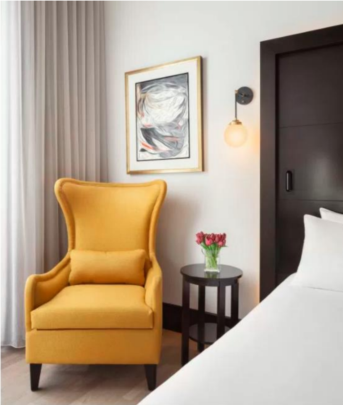
Old meets modern at the Hotel William Gray.