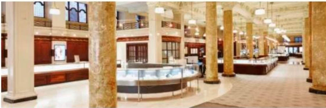
The Hotel Birks will be in the jewelry brand's flagship.

If Bulgari , Armani, and Fendi can get you in bed, why can't Canadian uber-jeweler Birks do it, too? Set to open in May, Hotel Birks will transform the company's landmark sandstone flagship into a 120-room, five-star property. Montreal's low-profile Le St-Martin Hotel group , which operates three midsize, middle-of-the-road luxury hotels across Quebec, owns it. Will the décor match Birks' signature bright blue boxes? Will bathrooms get bedazzled? The team's keeping mum (and a spokesperson wouldn't answer design questions) but the location at Ste-Catherine Street is already a winner. Montreal's first Saks Fifth Avenue's set to open across the street in late 2018 and leafy Philips Square, which the building overlooks, is slated for a makeover next year.